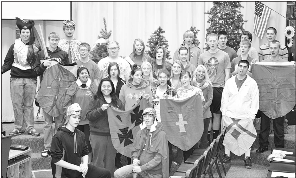
A group of Waseca High School choir students posed for a photo during rehearsal on Monday night.